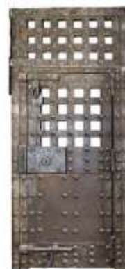
Newgate prison door, 1780

For six days London was ungovernable. Eventually the army was brought in to restore order. Around 700 rioters were killed, including 21 who were publicly executed.