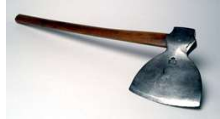
Axe made for the execution of the Cato Street conspirators, 1820

The five ringleaders were arrested immediately and publicly executed for high treason outside Newgate prison.