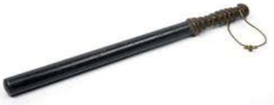
Special constable's truncheon, 1848

The Chartist movement was led by a group of working class men, including William Cuffay, whose father had been an enslaved African. They wrote the 'People's Charter' in 1838 demanding the right to vote for all men and that parliament be run more fairly.