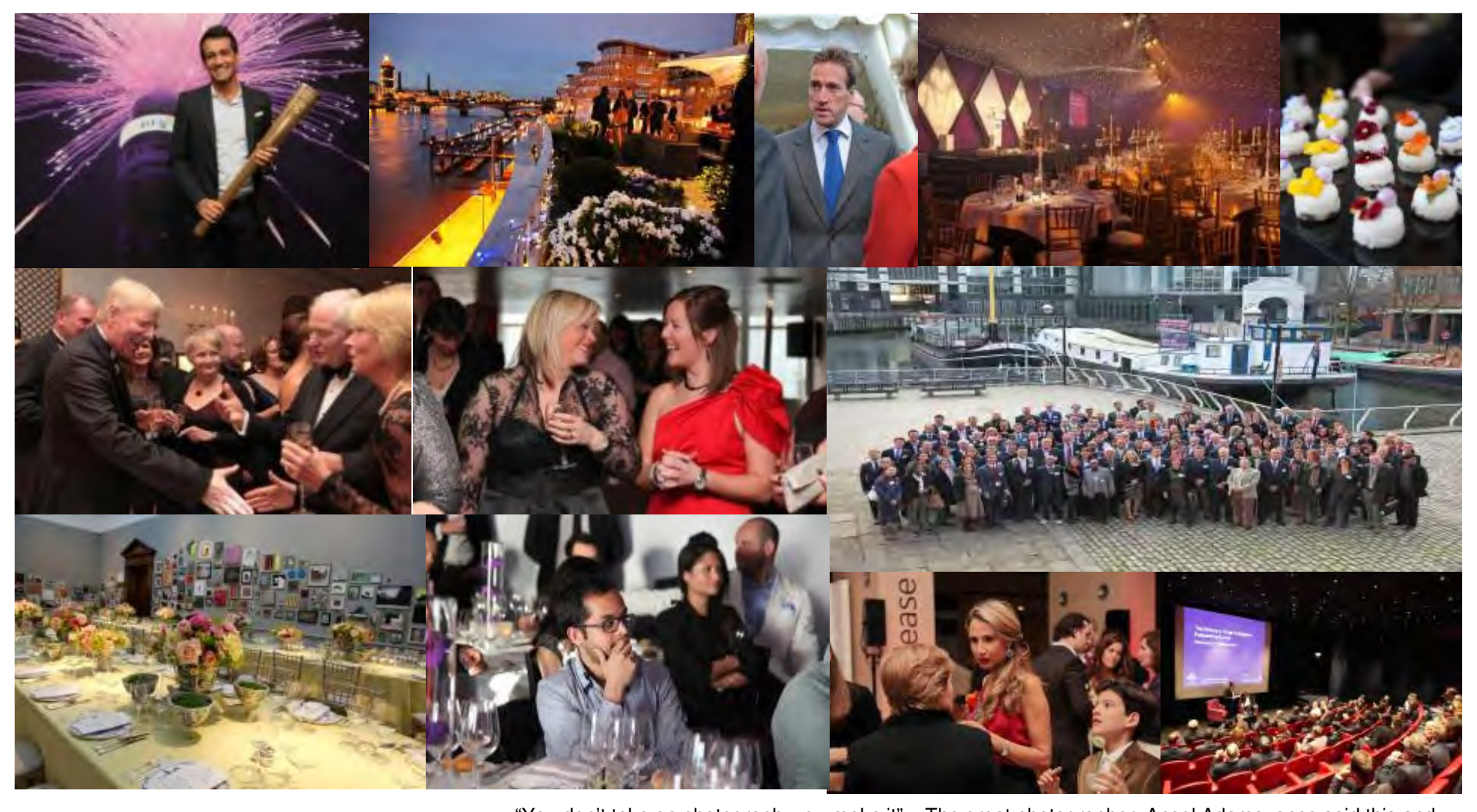
"You don't take an photograph, you make it" - The great photographer, Ansel Adams, once said this and there is a lot of truth behind it.