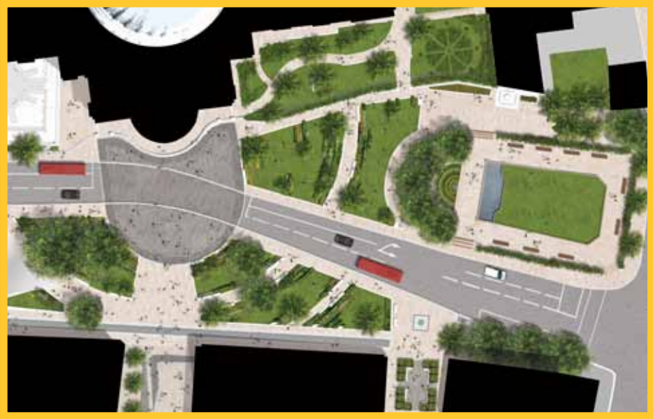
Landscaping of existing coach park

Landscaping works are expected to commence in August 2011, delivering a new and improved green space that will enhance the setting of St Paul's Cathedral.