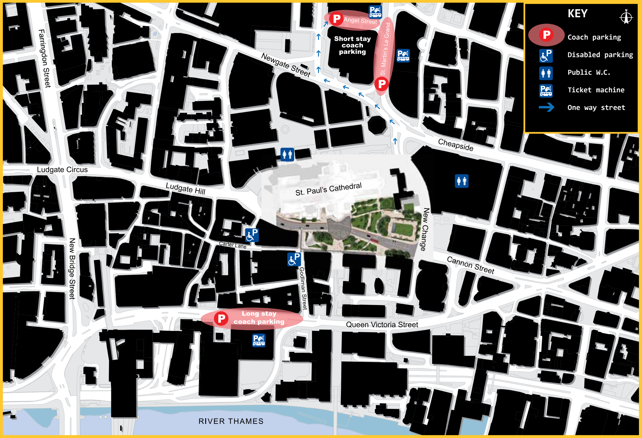
Re-location of coach parking & public facilities